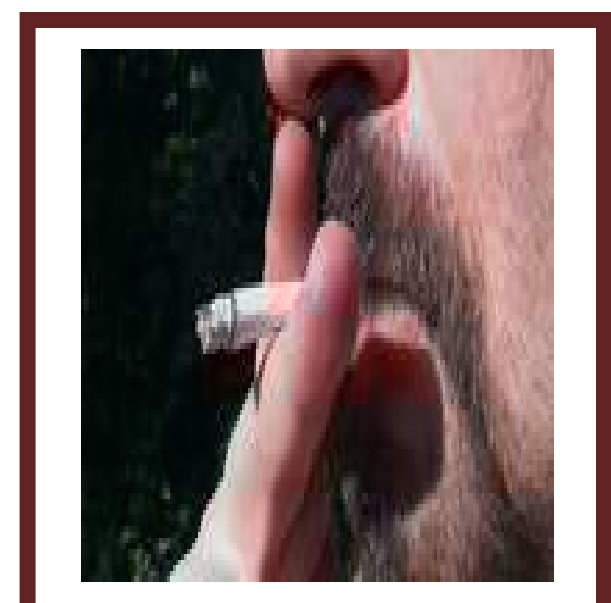
SMOKING GOD CALMET INDIAN GOD MUST BE DELIVERED

(In the beginning), because psychoactive substances bring about subjective changes in <u>consciousness and mood that the user may find pleasant (e.g. euphoria)</u> or advantageous (e.g. increased alertness), many psychoactive substances are <u>abused</u>, that is, used excessively, despite risks or negative consequences. With sustained use of some substances, <u>physical dependence</u> may develop, making the cycle of abuse even more difficult to interrupt. <u>Drug rehabilitation</u> can involve a combination of <u>psychotherapy</u>, support groups and even other psychoactive